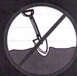
Dirt & Stones

Please prepare your yard waste properly.