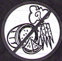
Fruits & Vegetables